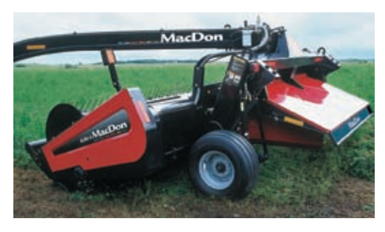
Like all MacDon machines the A30-S is built for the toughest conditions.

Representing the next generation in mower conditioners, MacDon's new A30-S has been engineered to deliver significantly